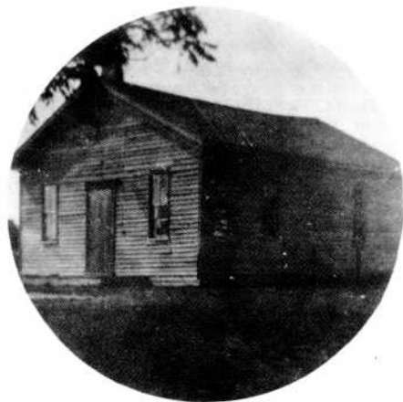
The Riverside church, known to Mennonites as the Miller Church.

Mennonite historians have noted that lack of leadership contributed to the decline of Black Creek Mennonites. Now that we're learning a little more of the Sugarloaf Mennonites, the same would seem to be true for them. As previously mentioned, I have found only one brief reference to a non-