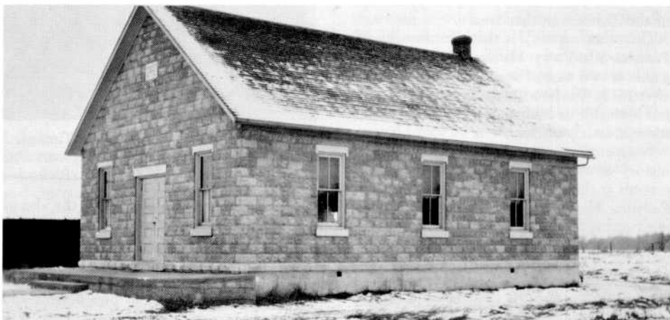
The Sherkston church, built in 1917 and sold to the Brethren in Christ in 1931.