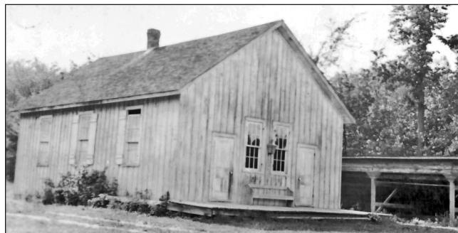
The church in 1930.

The first church was built beside Lake Erie where the Lakeshore Mennonite cemetery still remains, just a short distance south of the present-day