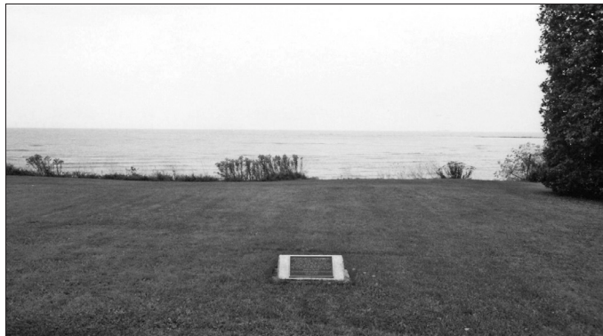
Close to the shore of Lake Erie is a plaque with the following inscription: "This plaque is erected over the foundations of the first church of the Rainham Mennonite settlement. This was the second oldest Mennonite meeting house in Canada. Constructed circa 1810, and served as the religious and cultural centre of the community for many years. The original meeting house was destroyed by fire and was replaced in 1870 by the present structure, located one mile north of this site." It was erected by the Rainham Mennonite congregation on its 200th anniversary (1993) and by the North Erie Shore Historical Society and the I.O.O.F. Lodge of Selkirk.