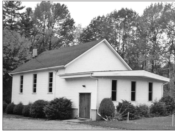
The church in 2000.

providing a new main entrance and a basement kitchen. An organ was also purchased that year. In the late 1970s new windows were installed, the sanctuary re-decorated and a piano was placed in the sanctuary. In the early 1980s a new roof and new siding was installed. The cemetery at the lake also needed some work due to erosion along the shore and a break-wall was constructed there in the spring of 1975.