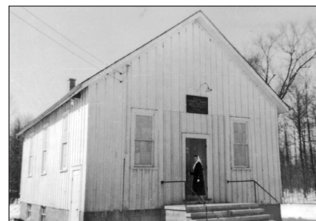
The church in 1960.

Rainham Township was very sparsely settled before 1816, but soon after that families moved to the area from other areas such as Vineland and Niagara. Family names came to include Shank, Swartz, Strickler, Sherk, Werner, Miller and Byer. At that time it was the only