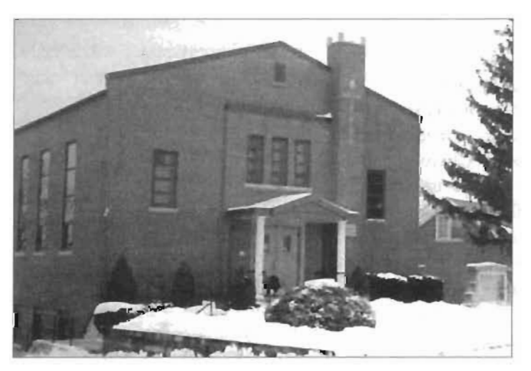
First Hmong Mennonite Church on 93 Doon Road in Kitchener: PHOTO CREDIT: MENNONITE CHURCH EASTERN CANADA