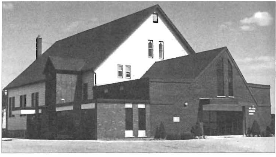
East Zorra Mennonite Church. Circa 1990.

Sunday May 17, 1903 was a day filled with many emotions. There was anticipation for some, and anxiety for others, so prayerfully they started Sunday School at East Zorra Mennonite Church. No one could see the future, but a variety of visions began to play out in their heads.