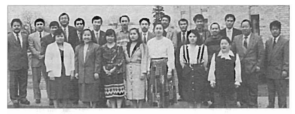
Students enrolled in T.E.E. course. Circa 1994.

having one or two children. This is done by the father and mother-in-law to indicate that the son-in-law is married and mature. An example of this is; the son-in-law's first name is Lee, the married name is Chung, his name is now called Chung Lee.